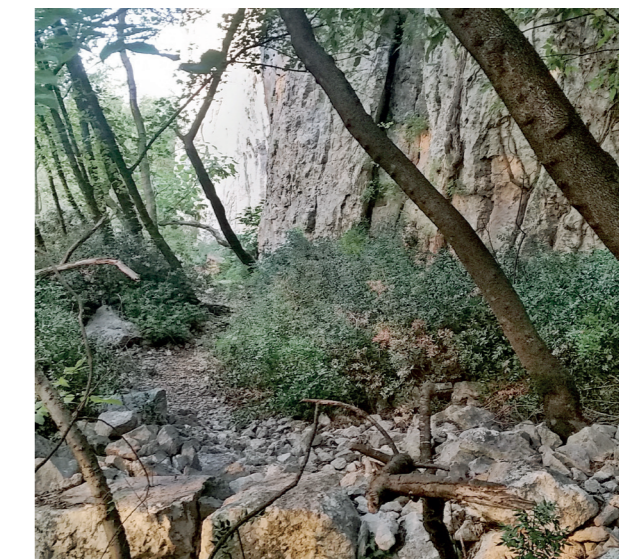
Rock climbing gym

From the central square of Domegliara, home to the local Wednesday market, you go along the main road of the town towards the station and take the cycle path in Via Sotto Sengia. After about 2.5 kms, leave the cycle path and go up the hill by a steep track that will take you past the La Grola Ca' Verde, where people practice rock climbing, and the sengie, a series of steep crags typical of this part of the territory. Immediately after, you leave the historic farmhouse Ca Verde on the left and go up to the Grola, the former provincial sanatorium, where there is a panoramic point. The area is surrounded by vineyards where the Recioto della Grola is produced, and rocky cliffs where Rosso Ammonitico marble is quarried. The road then gradually descends towards the village and towards Villa Rovereti-Zurla, a Venetian Villa now transformed into a private residence with a park and swimming pool, located at the foot of the Montindon hill. Leaving the Villa on the right you return to the starting point, passing in front of the parish church.