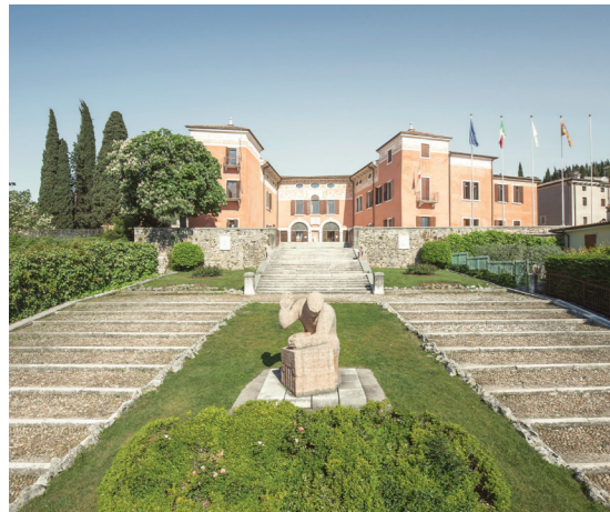
The Town Hall with the stone staircase

The path starts in Piazza Vittorio Emanuele II where the local market takes place on Sunday mornings and where, in the past, large wagons gathered, carrying the stone from the nearby quarries to the yards and the ports on the Adige river. The stone was loaded onto the burchio, a boat that sailed downstream and returned upstream pulled by oxen or horses along the towpath or cavallara.