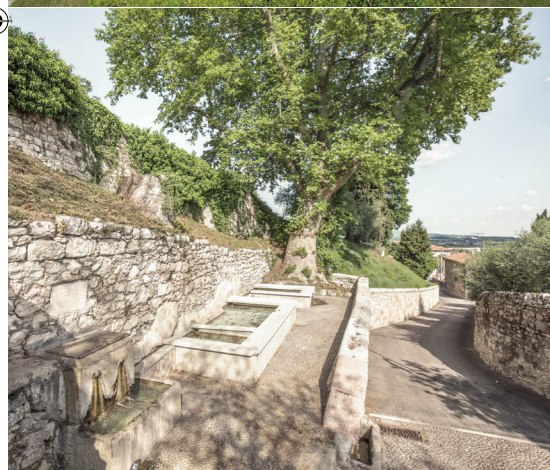
The Old Fountain